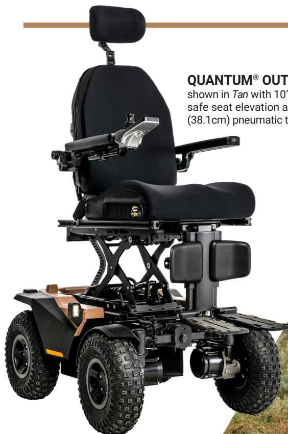
QUANTUM® OUTBACK® 4x4 shown in Tan with 10" (25.4cm) safe seat elevation and 14.5" (38.1cm) pneumatic tyres